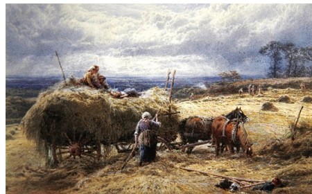
Mid 19th century haywain scene by artist Myles Birket Foster